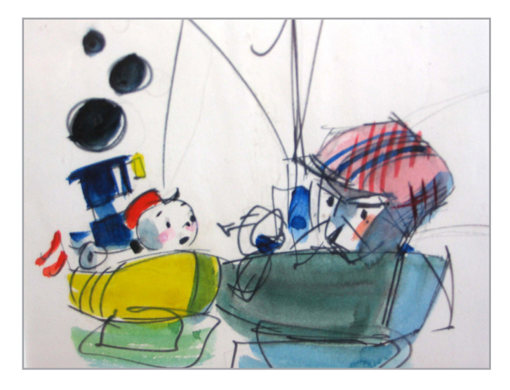
Did you know? The Custom House is open year-round.

Visit the Custom House for programs, classes and fun. Our two special tug exhibits have been extended to run through April 15.