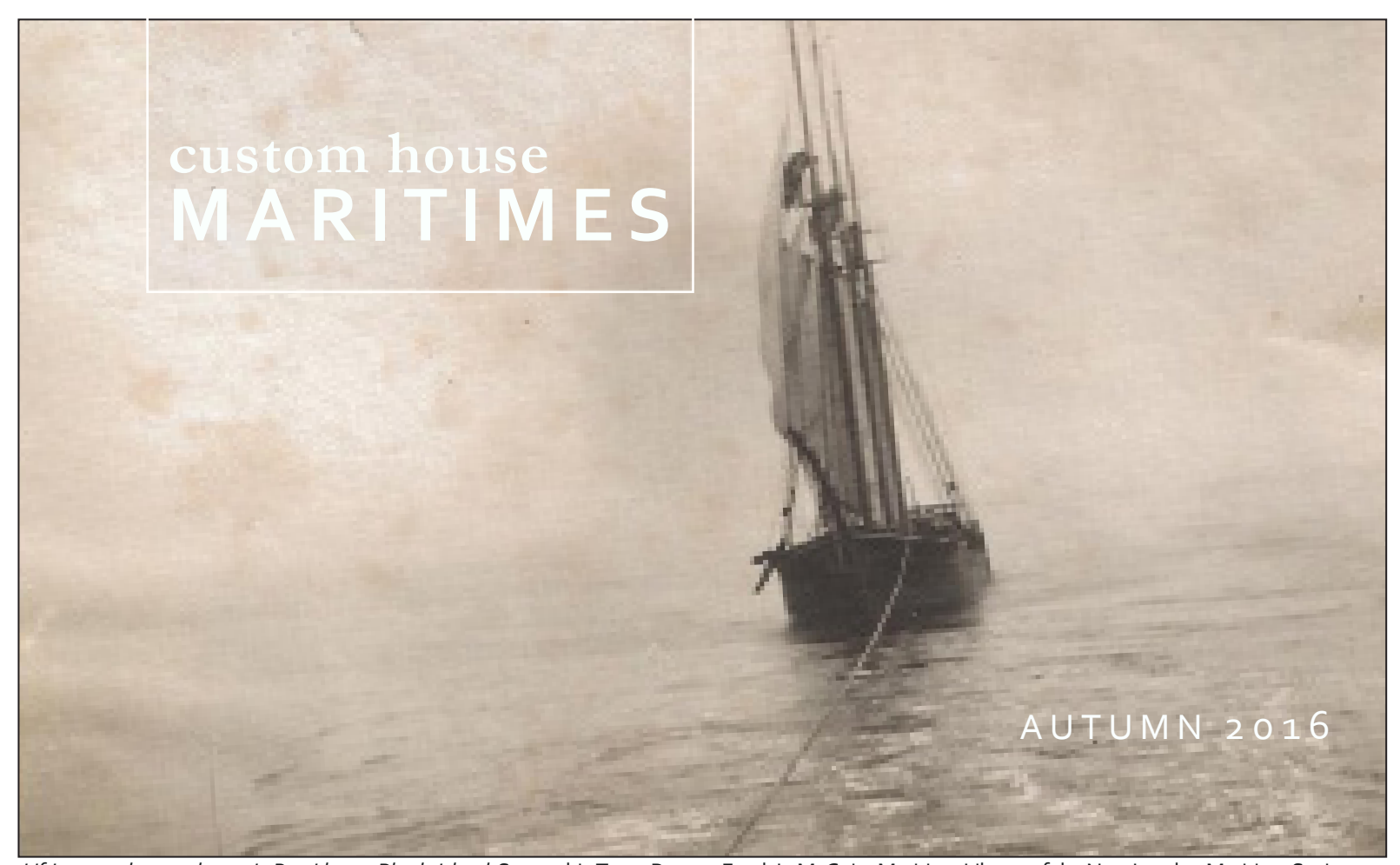
\label{lem:limit} \textit{Lifting a sunken mud scow in Providence, Rhode Island, }