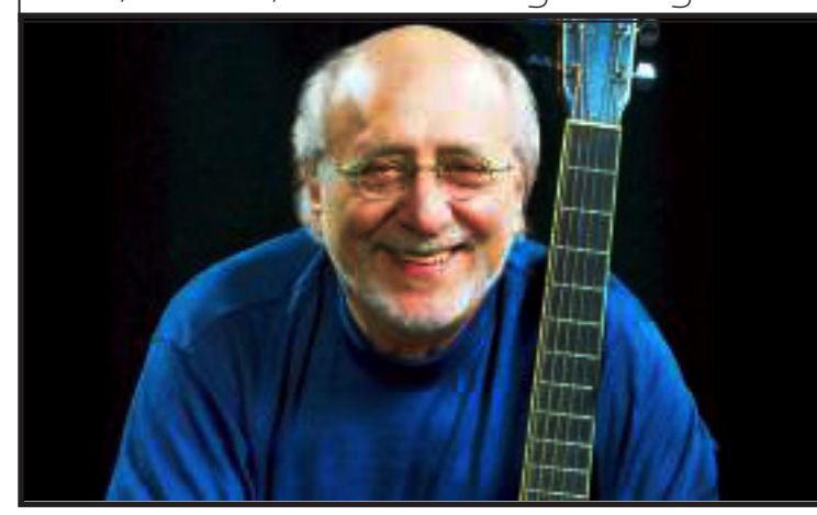
An Evening of Song & Conversation with Peter Yarrow