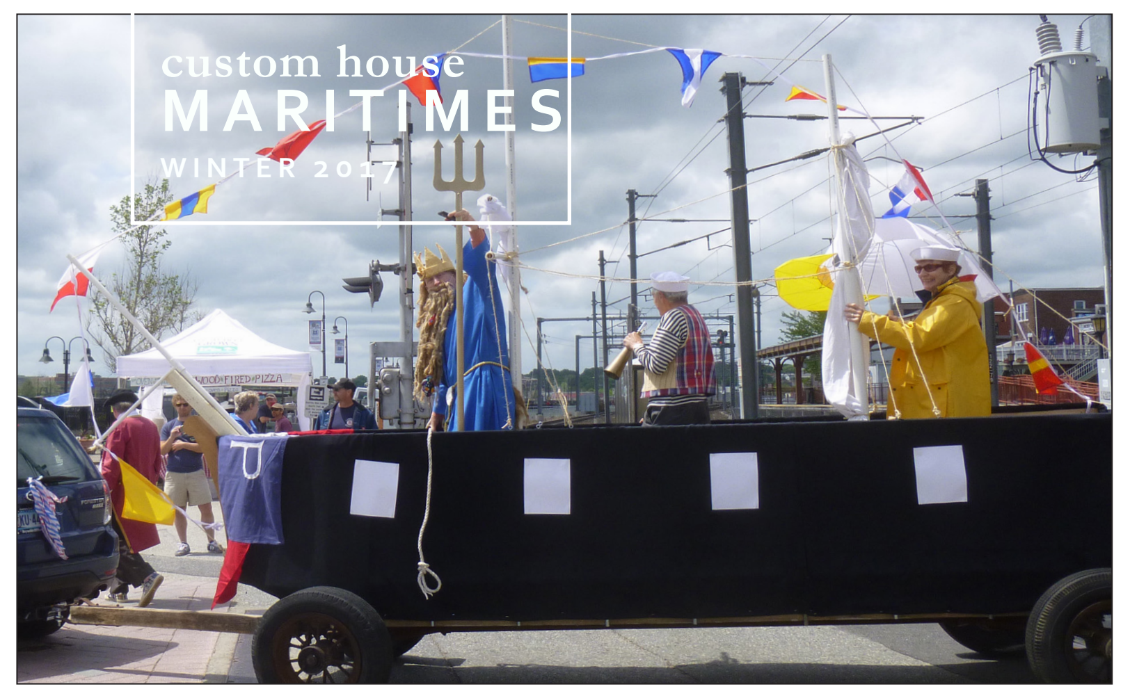
We're\ dusting\ off\ our\ Jibboom\ Club\ whaling\ ship-float\ for\ New\ London's\ St.\ Patrick's\ Day\ Parade.\ The\ parade\ takes\ place\ Sunday,\ March\ 12,\ at\ 1\ PM.