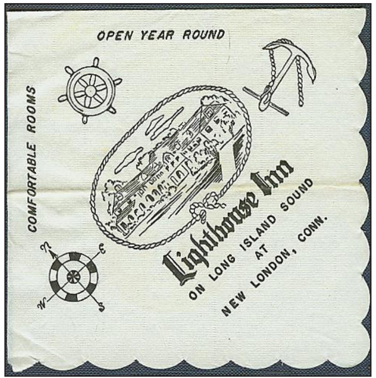
Above, an original Lighthouse Inn napkin