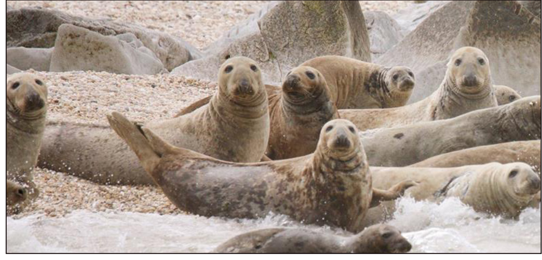
This photo was taken by a guest on last year's seal trip with the Black Hawk.

The Black Hawk is donating an exciting trip to view the many seals who winter off New London. It's a 2 1/2 -3 hours round-trip and a fund raiser for NLMS. On this trip, we'll leave from Niantic and head out to Little Gull and Plum Islands.