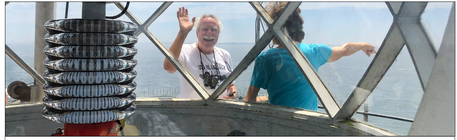
Wanna go?! Climb up inside the lantern room at Ledge Light. We have all kinds of lighthouse tours -- by boat & by land -- to bring you inside our local beacons. Go to nlmaritimesociety.org to register.