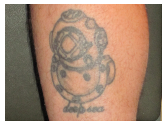
Seeing our deep-sea helmet in the window, a Navy diver stopped in to show us his!