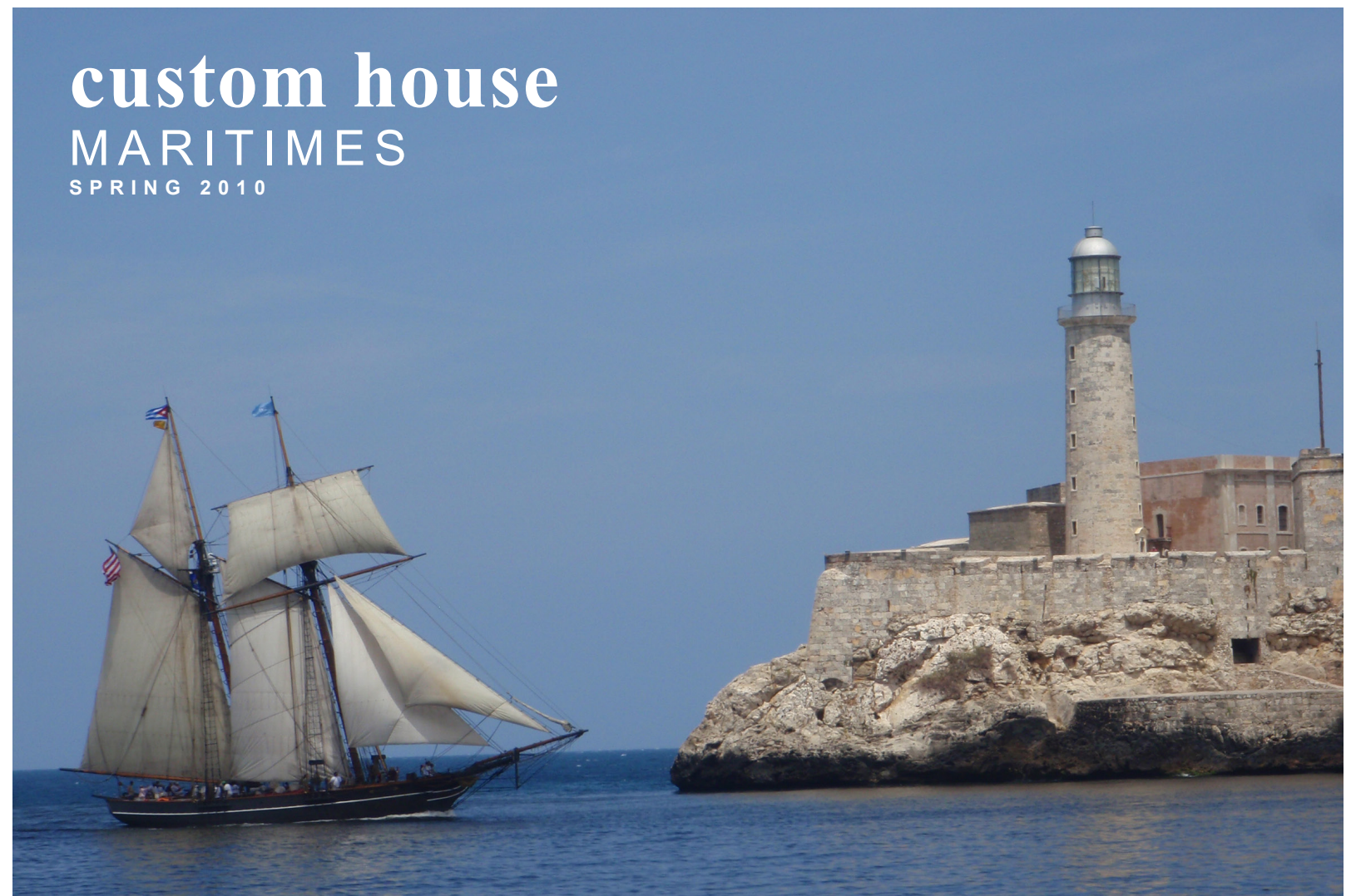
The Amistad entering Havana on March 26, 2010.