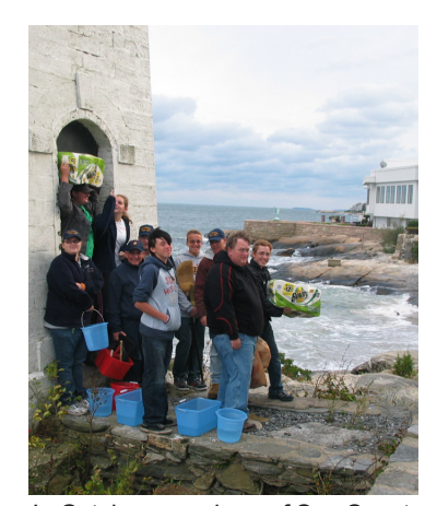
In October, members of Sea Scout Dragon Ship 584 volunteered to clean New London Harbor Light in preparation for visits by the Lighthouse Kids.

April through December, the Custom House is open Tuesday through Sunday (closed Monday), from 1 to 5 PM. January through March, our hours are Thursday, Friday, Saturday & Sunday from 1 to 5 PM, or by appointment.