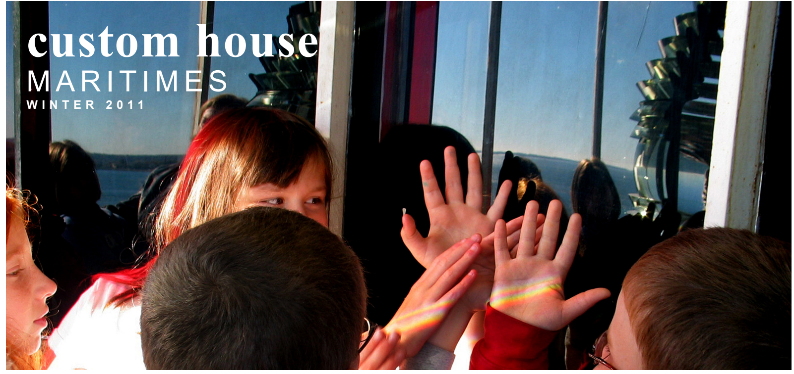
New London Public School 4th-grade SEMI students discover rainbows of light refracted through the Fresnel lens in the lantern of New London Harbor Light.