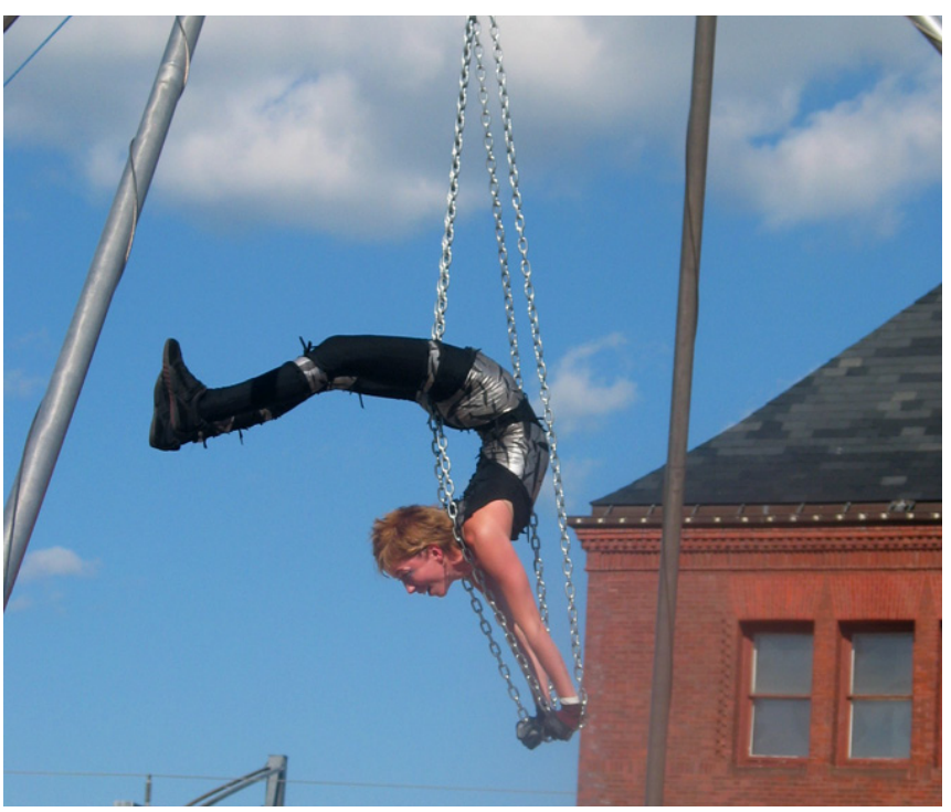
Nimble Arts Circus returns with two free performances and a juggling workshop on July 14 as part of Sentinels on the Sound: New London Lighthouse Weekend / Don't Miss the Boat.